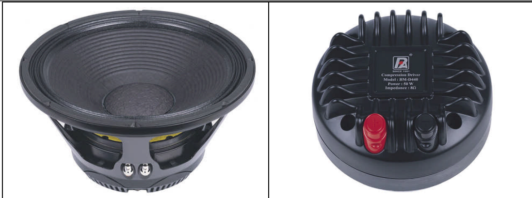
New units from P.Audio System at Musikmesse Frankfurt include the Flagship Series FL-15LF high-output LF driver (left) with wide bandwidth for the bass and lower mid-range sections in two/three-way designs; and the BM-D440 high-output compression driver with 1-inch/50 mm throat exit and CRT technology

Note to magazine editors and writers: High-resolution copies of this image in TIFF/JPEG formats are available upon request