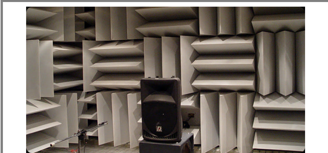
A large anechoic chamber provides an ideal environment for product evaluation and development at P.Audio System's main factory in Thailand.

Chen cites three factors that make P.Audio System loudspeaker components an ideal choice for end-user customers and OEMs. "Firstly," he considers, "our in-house production and R&D facility offer a high degree of confidence for customers. Secondly, our short delivery lead-times, competitive pricing and high-quality production add to that customer satisfaction. Finally, we can build just about any high-quality product to any specification standard that matches our customers' needs – a major benefit from our vertical integration."